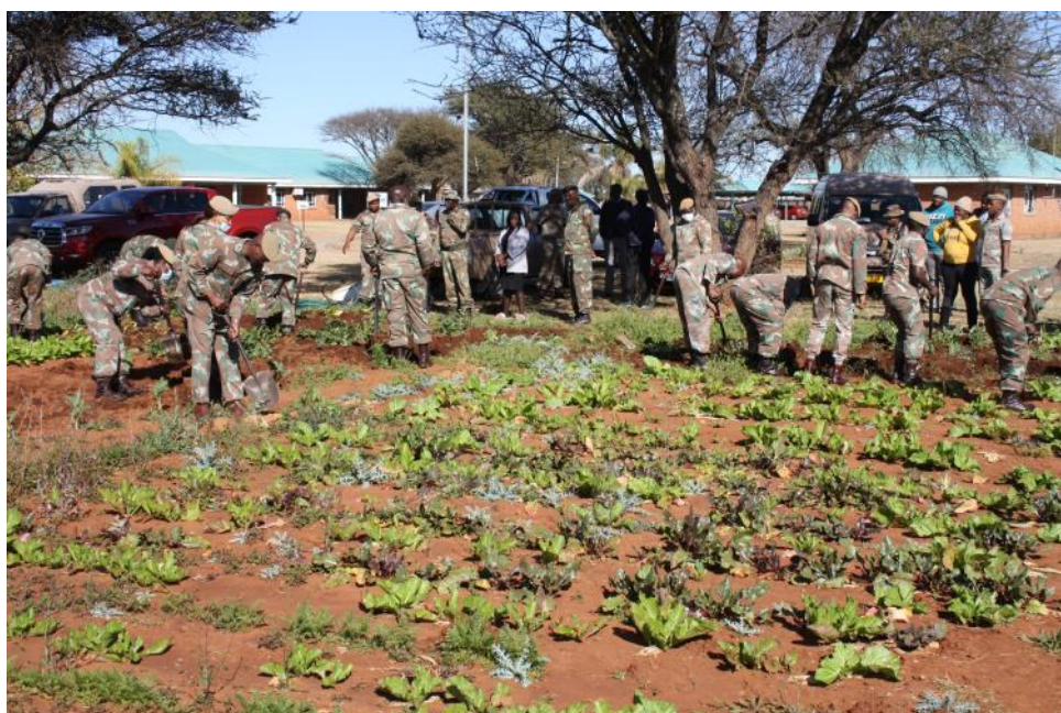
The South African National Defence Force Limpopo signal unit replants the vegetable garden at the Polokwane Welfare Complex.

bring a smile to the children at the centre. "To you it might be little but to us it is a lot", he added. 67 minutes are dedicated to helping others every year on Nelson Mandela's birthday, 18 July. It is 67 minutes to mark the 67 years of Nelson Mandela's political career serving the people of South Africa. This day is celebrated world wide.